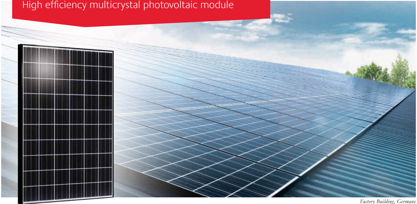
Factory Building, Germany